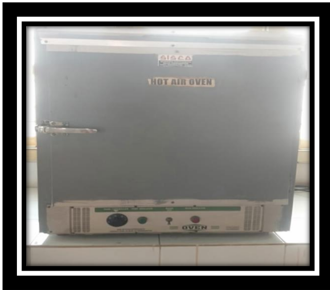
Hot air oven